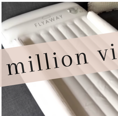
Testing Flyaway Kids Bed viral video